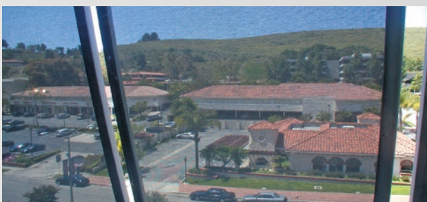
Outward visibility maintained