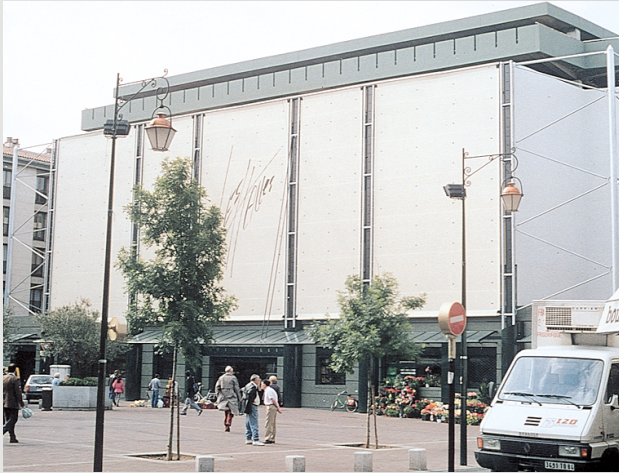
Long-term structural strength and aesthetics