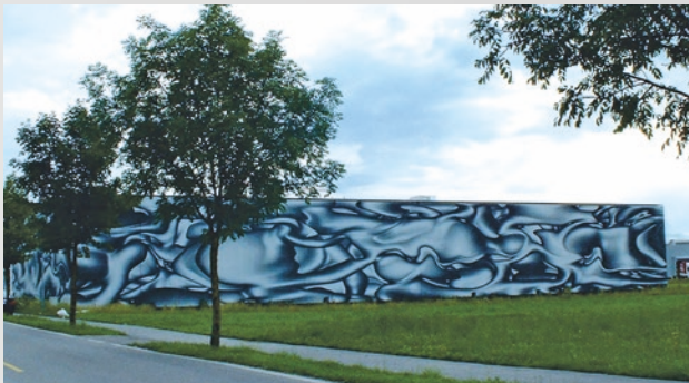
Living, changing facades

(tests conducted on a multi-storey car park facade installed in 1994 - photo opposite)